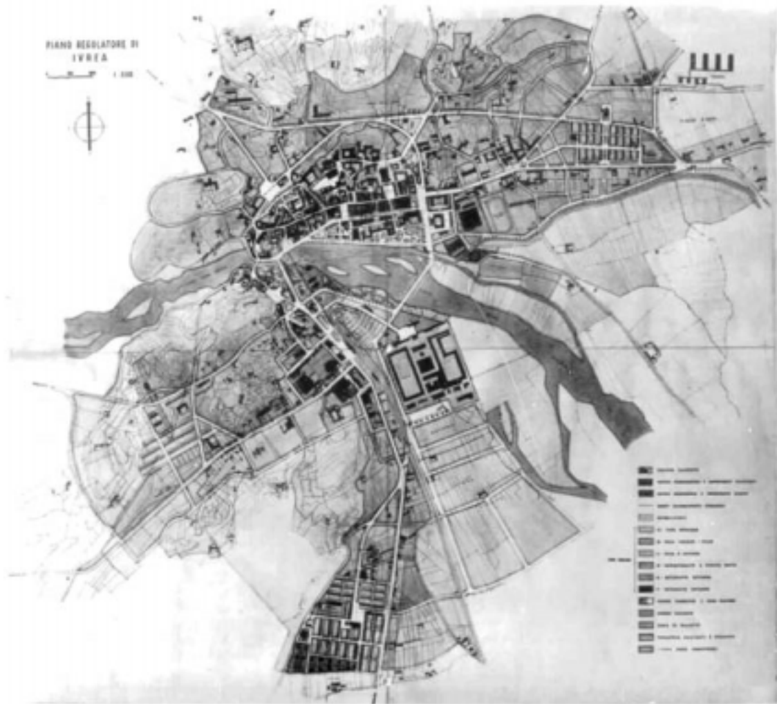
1938-1942. Town-plan of Ivrea