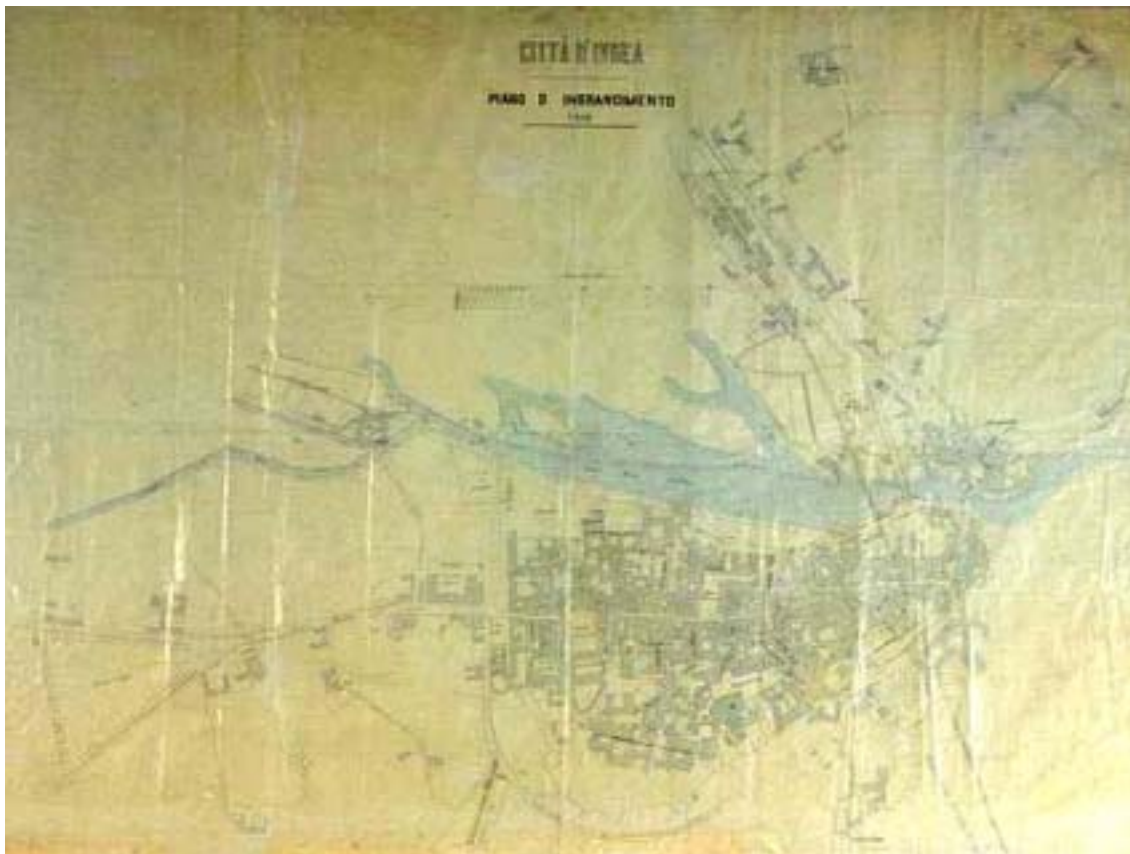
1906. Town-plan of Ivrea

The town-plan drawn by Giacomo Caviglia in 1906 was based on the previous town-plan drawn by Gioachino Lomaglio at the end of the XIX Century ( Piano regolatore di ampliamento della città di Ivrea 1880-1883 ). [Ufficio Tecnico di Ivrea]