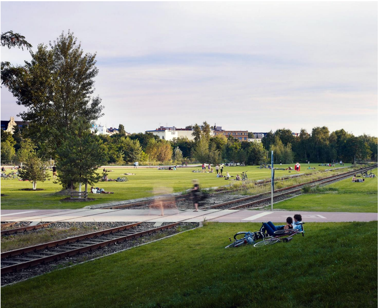
Park am Gleisdreieck, Berlin, 2006/2014 www.atelier-loidl.de

Overall, the selected projects highlight significant trends through which the landscape project rewrites the city within specific images. Today we are somewhere else than in the past. Everything is changed and the most notable change can be seen in the passage from the exhibition of opulence to the one of thrift. Although this is not the only possible interpretation, it becomes the key through which this thesis attempts to investigate how and how much the landscape project is able, now as before, to capture and give back the change of urban and social sites.