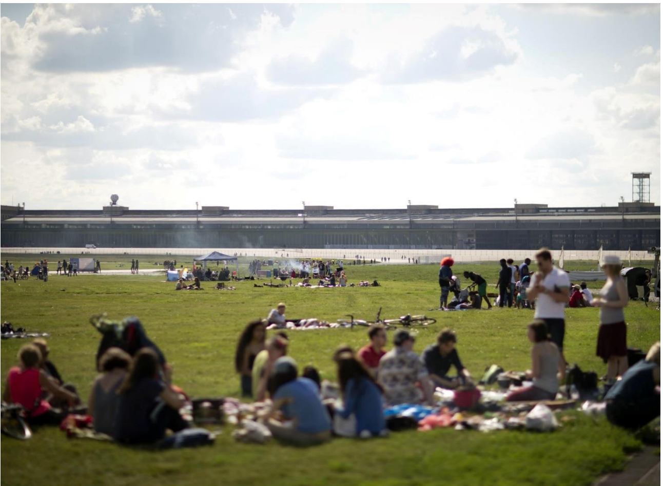
Tempelhof Park, Berlin, 2014

To research and study the current condition of the landscape design, both in its practical dimension and theoretical development, the definition of the method of investigation is essential. Even more it is crucial to recognize the changes that occurred in the design of open spaces in relation to the project for the city or to the new social, economical and environmental needs.