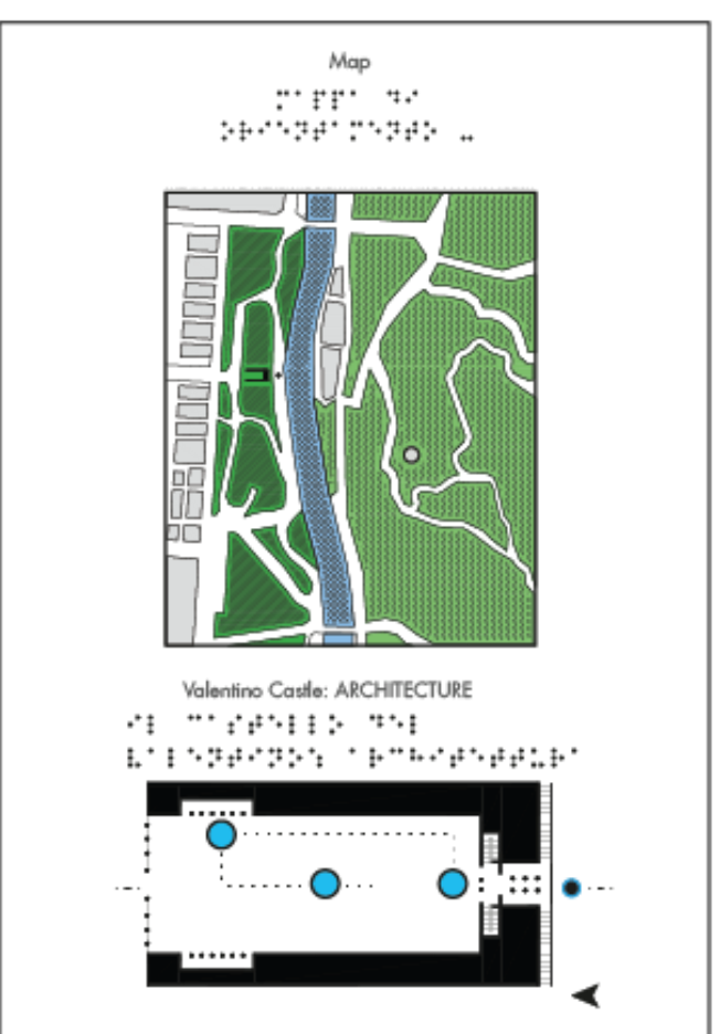
Figure 03. Example page of The guide for The Guide