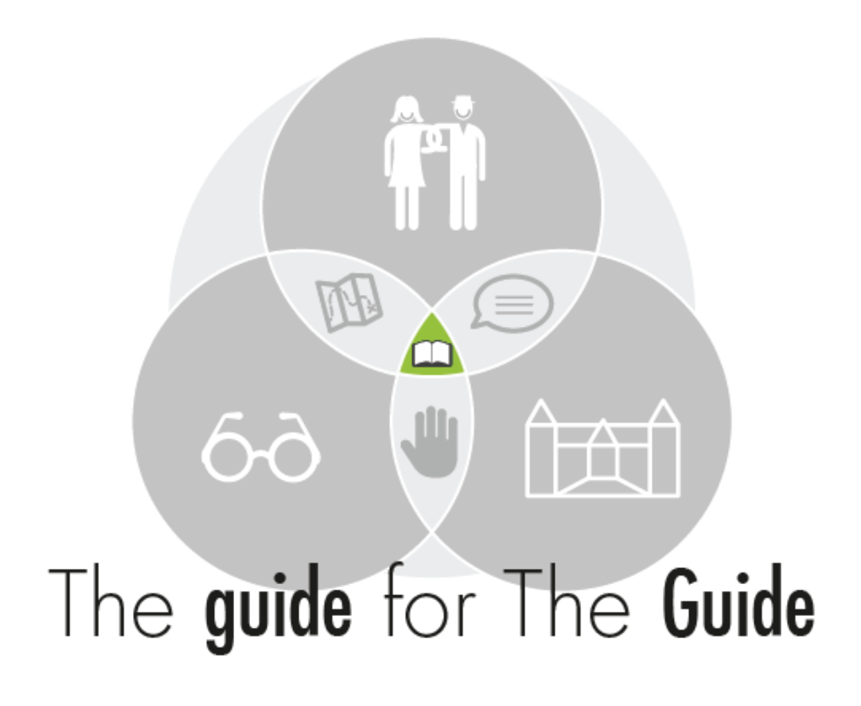
Figure 01. This picture shows the relationship between the subject of The guide for The Guide