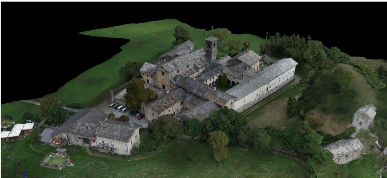
Photogrammetric model of Novalesa Abbey

Over the last decades the abbey has been a subject of research and it has undergone excavation and renovation works. In 2015 a measurement campaign has been conducted, during which the UAV and LIDAR photogrammetric surveys have been conducted.