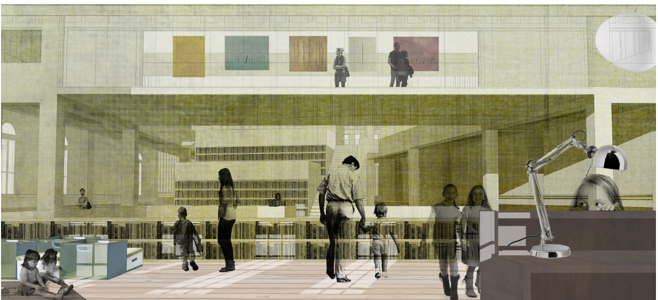
Figure 3. Inside view, childhood area.

Like in the childhood area, although the workshop room and the exhibition area have a visual relationship to what is happening inside of the media-library, thanks to the play of double-height spaces and glass walls. The new structure of reinforced concrete and steel is separated from the existing façade to avoid an additional burden to the pre-existence. Therefore, there is a system of double pillars that support the new floors posts at the same height as the previous ones, without touching the existing facades, that are consolidated through a perimeter reinforced concrete curb, placed on top of the decorative cornice of the existing buildings. The elements on façade of the new building recall heights and depths of existence. The facades of new buildings in the part of the older building are opaque, in black perforated oxidized corten. In the new building, the facades are glazed with vertical elements in black oxidized corten that give rhythm to the prospectus and make sure that does not enter direct light could be source of glare to users.