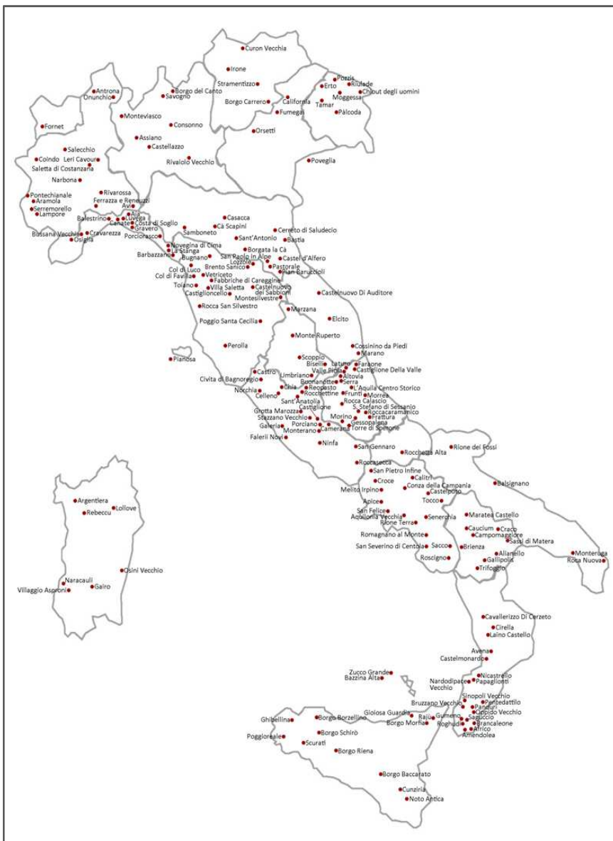
Fig.1_ Map indicating the 195 abandoned villages encountered and cataloged on the Italian territory, by region.

The abandoned villages are small forgotten cities, actually surviving on the margins of everyday life in the silence brought by the disinterest of people and institutions; however, the phenomenon of so-called "ghost towns" puts in front of a situation of loss of architectural and cultural heritage continues to increase. This is the starting point of this thesis, which aims to investigate a little known subject, on which the bibliography and research material in short supply, in order to arrive at some practical considerations about the future of these places. Starting from the study of the limited sources, it has been realized a mapping and cataloging of 195 abandoned villages on the Italian territory, which represented a good basis for reflection. The analysis of this series has been able to investigate the causes of the phenomenon and developments, until you get to propose some types of intervention possible.