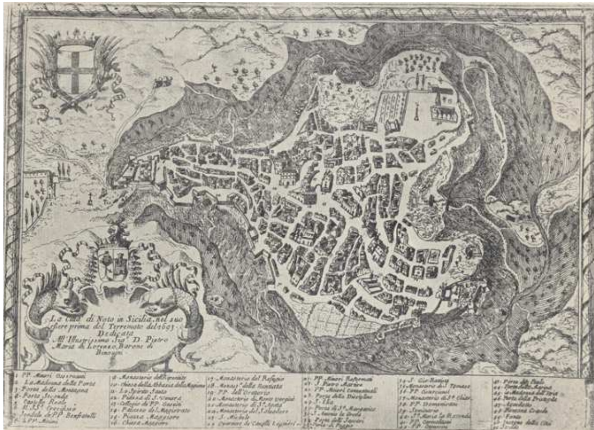
Fig.2_ Carving a panoramic view of Noto Antica reproduced from a lost original.

The core of the thesis is represented, however, the investigation of a case study, used as an example to propose transactions that could constitute an intervention method of similar enterprises. The choice fell on Ancient Noto, in Sicily, the city destroyed by the 1693 earthquake and forgotten for centuries on top of Mount Alveria, a few kilometers from the current city of Noto, famous throughout the world as inserted, along with other seven cities in the Val di Noto rebuilt after the earthquake, in the UNESCO World Heritage List in 2002. The special, which led to decide for the study of this abandoned village, it is the proximity of this unknown heritage with the city considered one of the "pearls of the Baroque", a tourist destination internationally and protected by larger institutions.