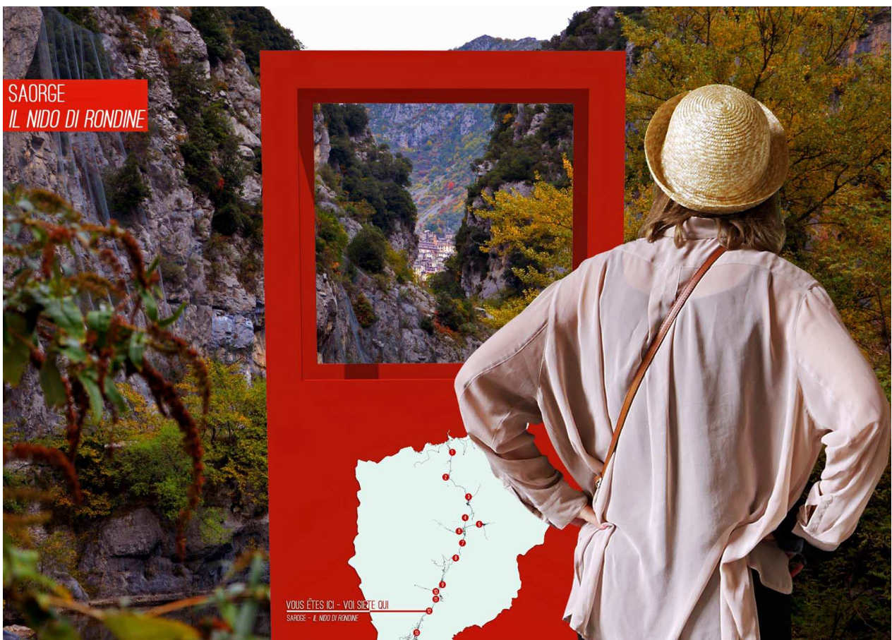
Part 3: design project to connect the traveler with the cultural landscape of the valley