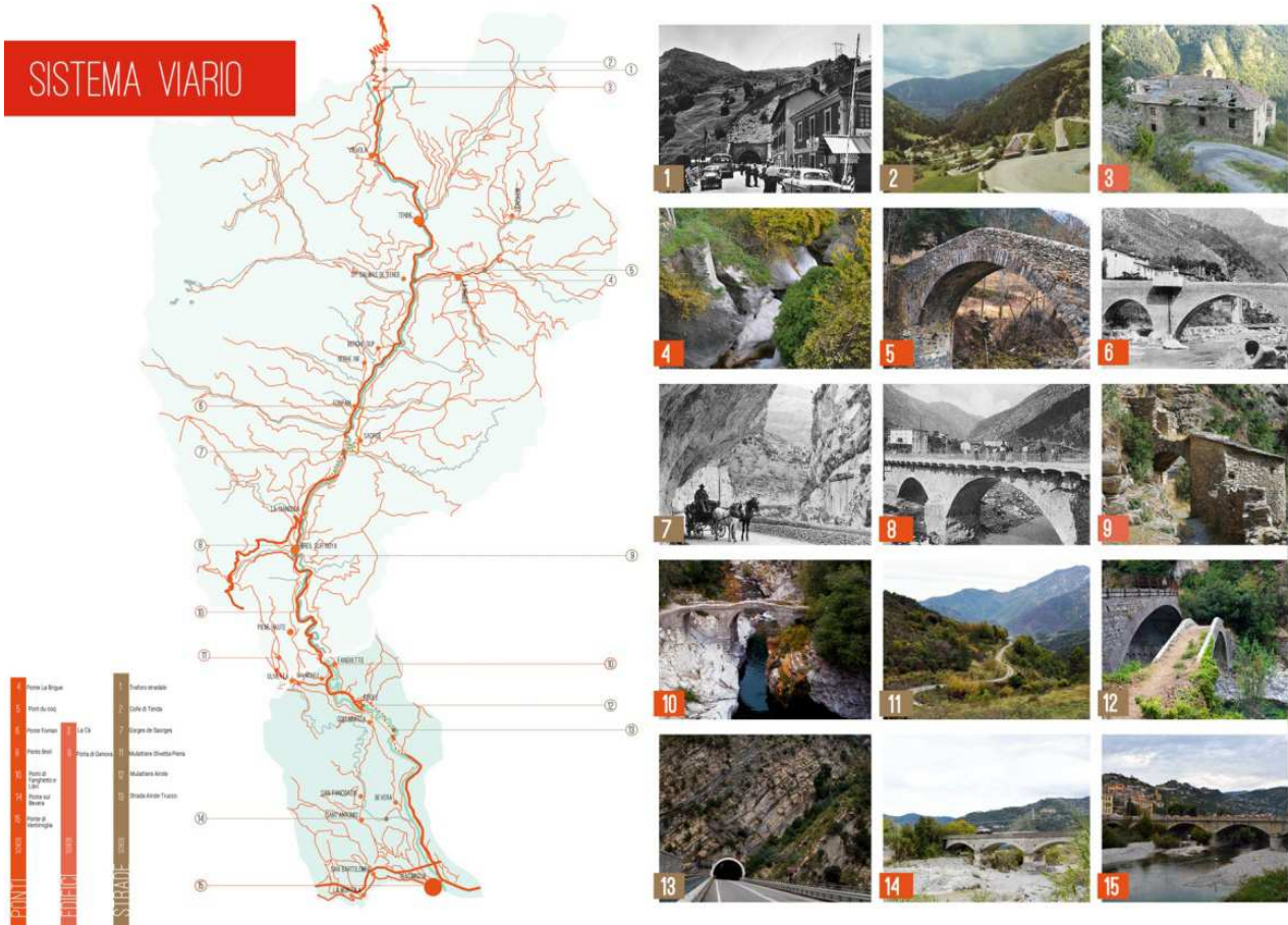
Part 2: identification of the material traces of the infrastructural systems