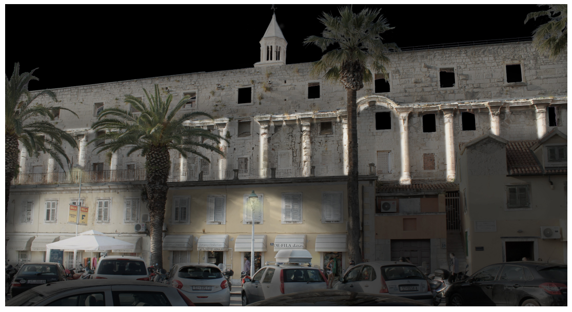
The illumination's project of the south wall of the Palace.

In conclusion, my thesis mainly focused on the studies and planning of accurate interventions, so as to enhance the Monument and its historic context, with particular interest over the sustainability .