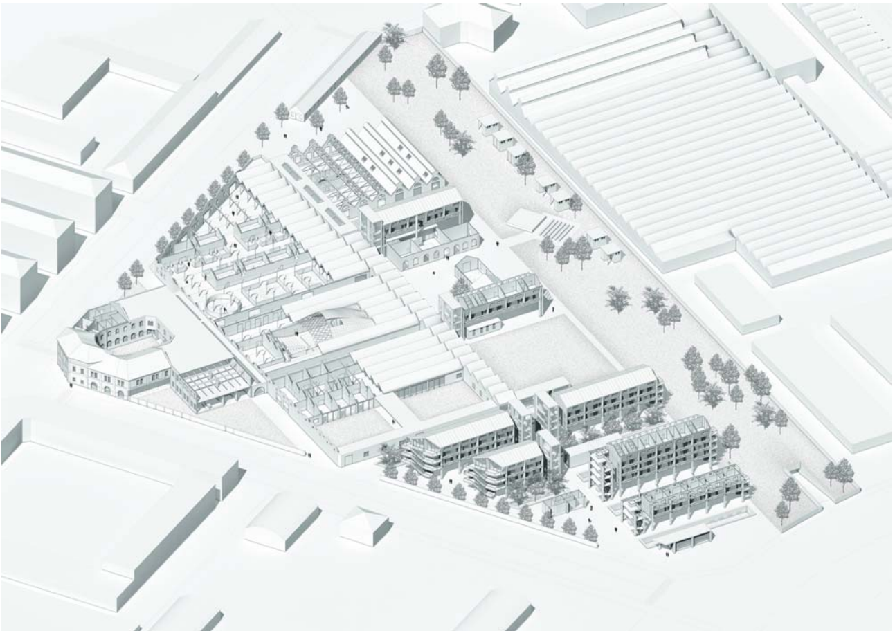
Enhancement project. Exploded Axonometric View

In conclusion, the proposed redevelopment and enhancement project tries to connect the meaning of the former industrial and military area with the contemporary processes of urban development, preserving a memory of the city, but also offering a place to live in the present.