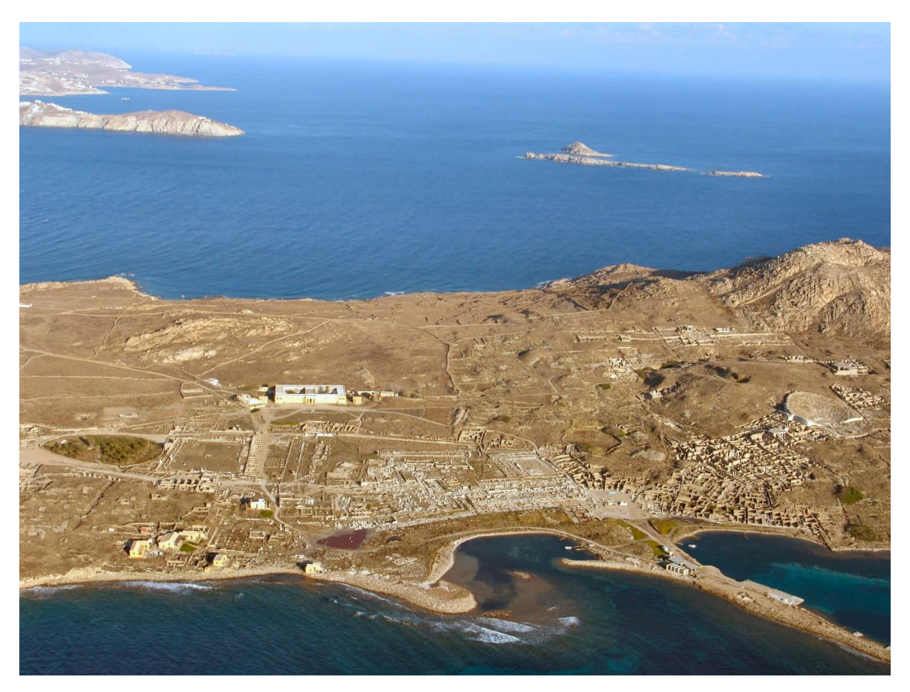
Figure 3: Aerial view of the island from the northwest

The starting point is a bibliography rather large, carefully researched and selected; the rich iconographic and cartographic, many of them unedited, were taken from: the photographic and historians archives of the French School in Athens, the archives of the National Library of France in Paris, and the archive of the "Archaeological Explorations of Delos" published by French School since 1877 until today. The numerous photographs taken in situ during my inspection, with bibliographic sources and attachments final complete in exhaustive way this research work.