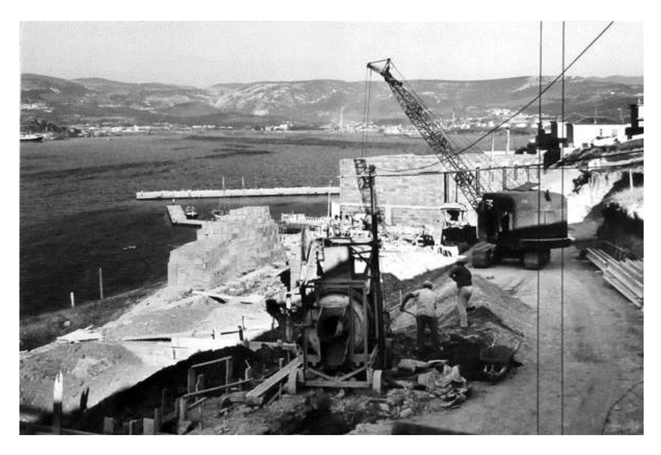
(immagine1: Work in progress in Borgo San Cristoforo-Muggia, one of the new village for refugees - Sixties.)