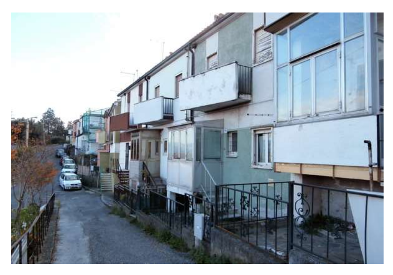
(immagine2: Borgo San Cristoforo today.)