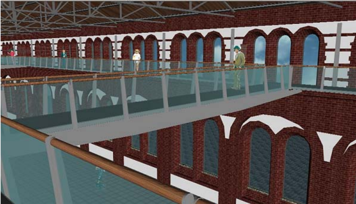
Exhibit space of the Science Center: footbridges

The project starts up comparing glass potentialities and opportunities of contest, that means it is related with building lot and town-planning implications, with pre-existent building and its own properties, with needs generated by new functions, and, not least, with technical-constructive matters, with the attention in calculating the iron structures that support glass elements and with the analysis of some of most important particulars.