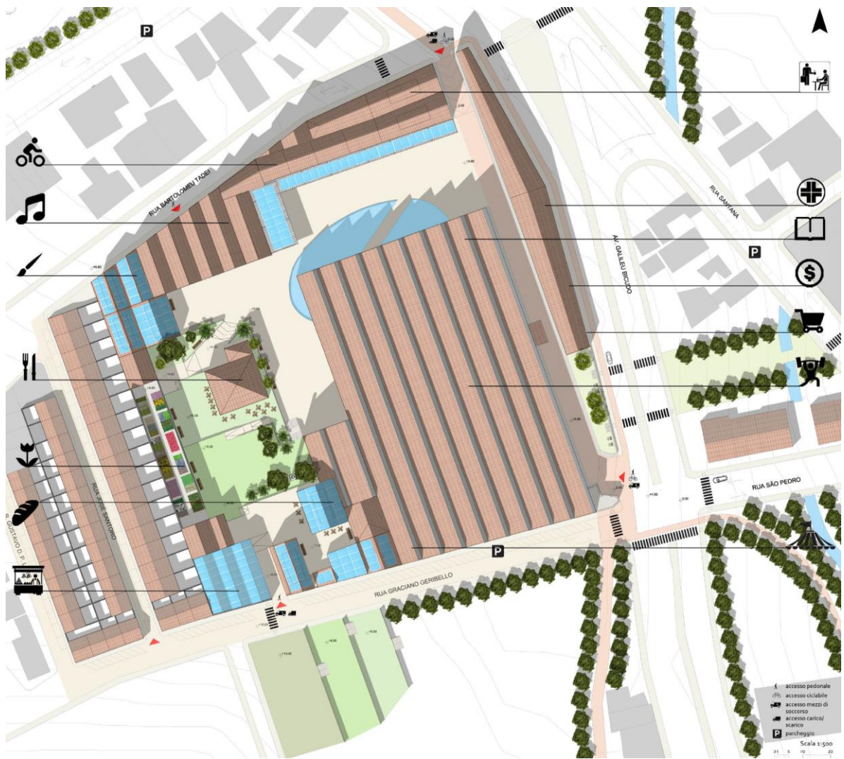
Figure 3: Masterplan project of re-functionalization of the old factory.

For more informations: Giulia Vercelli, email: vercelli.giulia@gmail.com