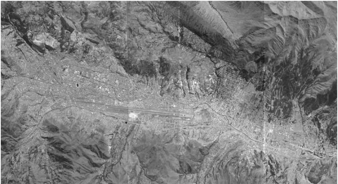
Image 1. Satellite Picture

Today more than 120 hectares of the town centre are occupied by Alejandro Velasco Astete national airport. Its runway divides the city into two parts, a city grown longitudinally constrained by the valley. There is a debate going on about the strengthening and the transfer of the airport in a more suitable place for receiving international flights: its movement will release in the middle of the city a huge empty area, almost half a kilometer wide and more than four kilometers long. This territory is deeply damaged from previous use and it's the object of big and complicated property interests.