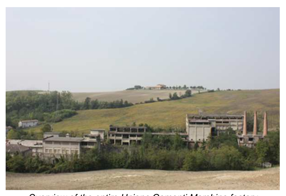
Overview of the entire Unione Cementi Marchino factory

This master thesis deals with measures of safeguarding, conservation and valorisation of the industrial heritage located in Monferrato's area. The focus in particularly oriented to Ozzano Monferrato's industrial buildings. They are disposed on a hypothetical itinerary that retraces the historical route, which allows the subject to go through the old processing circle, from the raw material to the finished product. Nowadays they still could tell the story of the cement's local production, flourishing industrial activity which involved the entire community in the past. Above all, the origin and development of the disused factory Unione Cementi Marchino named "La Fontanola" is the purpose of this work.