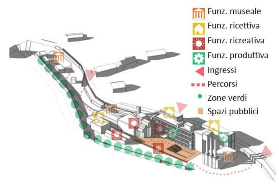
Masterplan of the project area and general distribution of the different service

The preliminary phase concerns the analysis of Ozzano's territory, which includes an analytical schedule of each building composing the industrial complex. The central aim is to fully know the factory and to evaluate which parts could be maintained or demolished, in order to write up the masterplan, which has the purpose of assign a different function to each building. The most representative buildings are the silos for the cement and the old furnaces that with its three chimneys make more recognizable the historical production cycle. These buildings are planned to keep the as possible as its original forms.