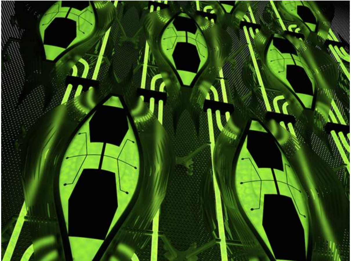
Night view of the cladding system