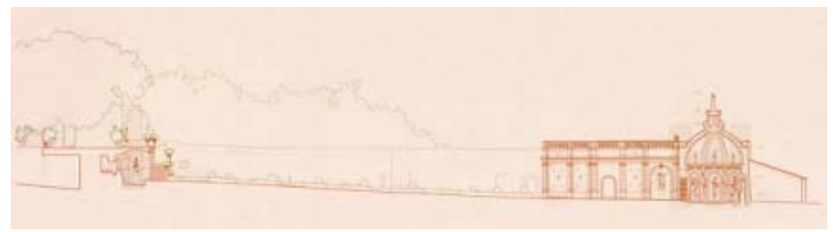
Cross section of the ground

whilst the instrumental survey helped for the hydraulic study through space, volume and placing of objects. From the analysis on the area emerged that the reason for such deterioration is to be found in the same nature of the place: the water penetration has effected the structure deeply, down even, in the ninfeo, to the staticity.