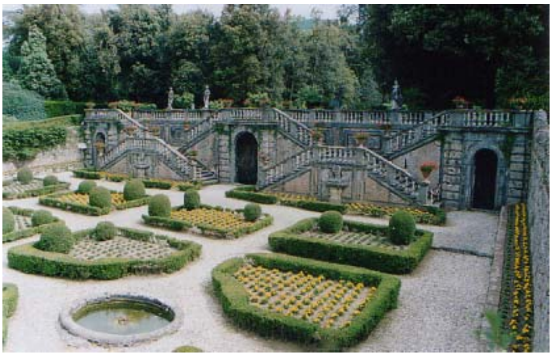
Flora Garden: view of the staircase.

Subject of the following thesis is the study of the Flora "secret " Garden, part of a larger mansion and gardens design in the 17th century forming a complex territorial system that is Villa Torrigiani in Camigliano (Lucca) today Colonna. The formation of the closed area, matured from the capsizing of the "chiusa" forms -intended as the largest conception of villa and garden- according to the north-south axis identified from the development of the fish pond, the favourable localization of the building at the time Buonvisi between the two waterways, rio Dezza and rio Gomboraio, the garden adjacent to the first of the two and lower than the surrounding contryside plane for better water supply, the higest composition individuated by the ninfeo of the winds, make this place the reign of the waters: a deep qualification and appropriation process of the contryside in a double control-dependence union between the territory and the settlement.