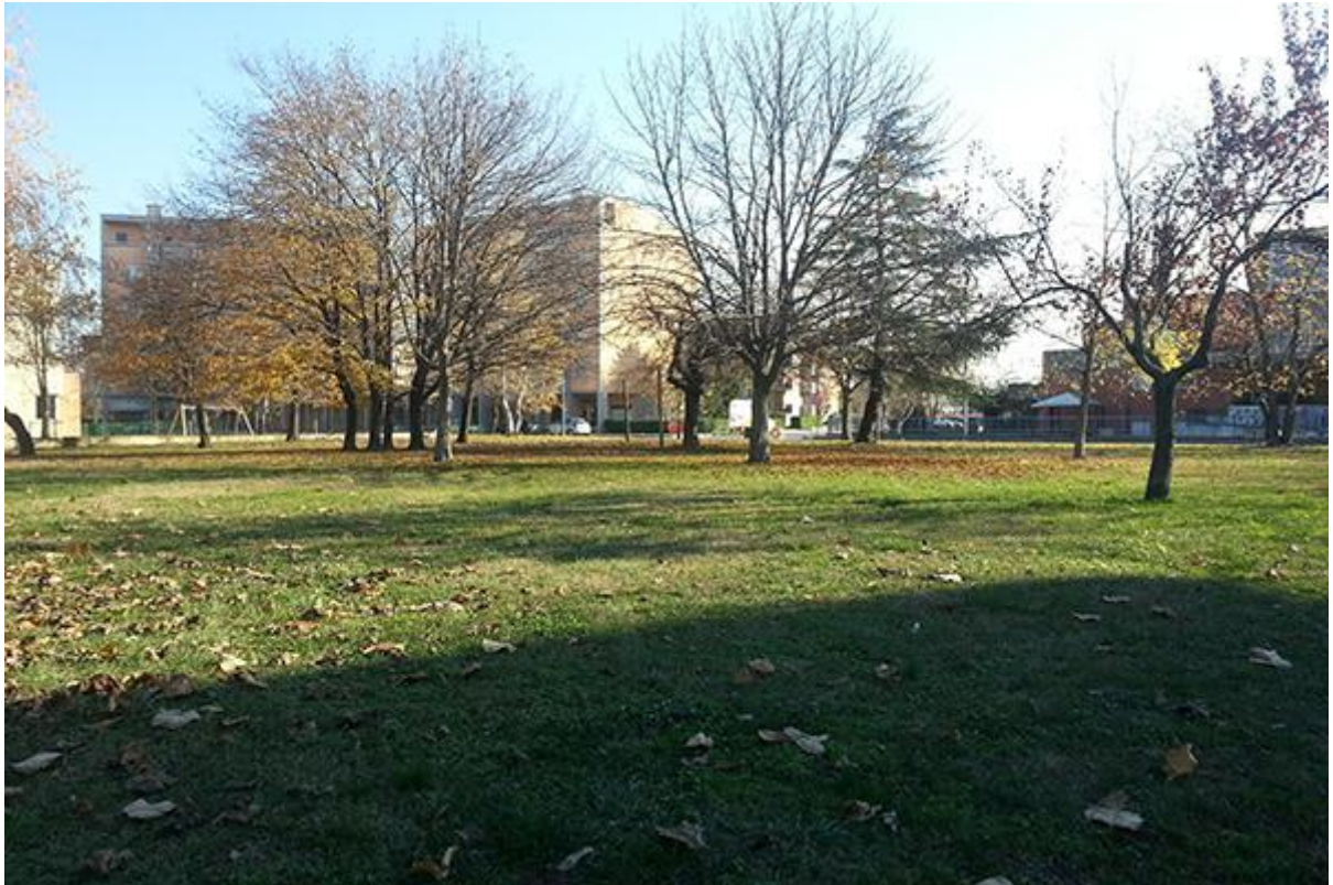
The garden Gaetano Capaldo, Via Federico Sacco, Fossano (CN), located in front of the Primo Levi's school and subject of redesign by children

The urban laboratory was started as an experiment and entitled "Arkitettiamo" in order to make an long lasting, able to work for a new philosophy of government of the city, taking children as a parameter of needs of all citizens. Not so a greater effort to increase the resources and services for children, but for a different and better city for all people, so that children can experience to be autonomous citizens and participants. Students who participated to do this activities questioned, in particular, the area Borgo Nuovo surrounding their school, taking into consideration green areas, cycle tracks and streets that run through every day to go in their institute. It is located an area that could be used as a public park and school garden of Primo Levi.