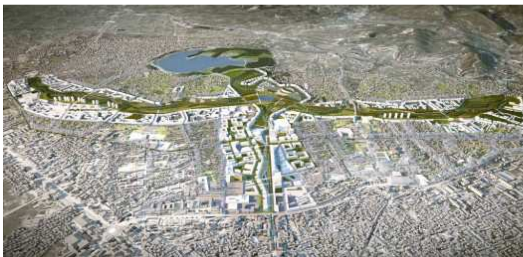
Masterplan of the proposal of Studio Grimshaw, 2013 ( www.grimshaw-architects.com )

The material obtained has been reworked with the aim of defining a taxonomy of the real problems and which, consequently, the proposals and solutions for each specific aspect of the city. Through the study of the transformation underway, we consider the urban policy, analyzing it through a critical reading, to understand the direction in which it is moving and Tirana to infer intentions and will.