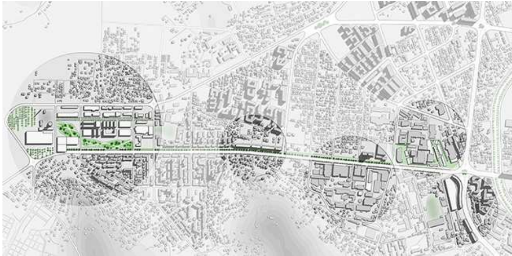
Identification of dowels of development between the complex of Kombinat and the river Lana.

Our proposal takes into account the east-west axis, the section between the complex and the river Lana Kombinat, with the aim of regenerating the area, providing a concrete strategy and practicable alternative to the one ongoing, different for modalities of the approach adopted, facing a pragmatic analysis. The convertibility of the area is made possible by the specific resolution of issues that arise from an analysis “piece by piece”, identifying four basic features: the use of the soil, to outline the different uses of land and buildings; the different properties, so as to understand the fragmentation; the building index, useful for quantifying the degree of intervention in the area; roads, that is the connections between the secondary system and internal connections to the main road structure. In this way it is possible the realization of the masterplan that affects the axis, joining the proposals made for each single dowel.