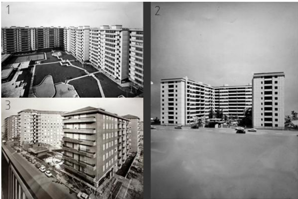
1. “Turin Park” in Cosenza Course. General view of the park, 1970 (Archive of “Società Generale Immobiliare” at Central Archive of the State, Rome, Fotoalbum, case 174).

The first part of the thesis is a solid starting point to explore the conditions generated in the years of economic boom. Subsequently in this section of research to develop knowledge closer to the activities of the SGI, the work continues with a second section more specific about the history of this big organization, its contribution in the development of the country from urban and technology point of view. After the history of the general framework of the activity of SGI performed in Turin, followed more relevant descriptions of each case study, accompanied by a illustrative collection and by a general plans that explains the context in which the building is located.