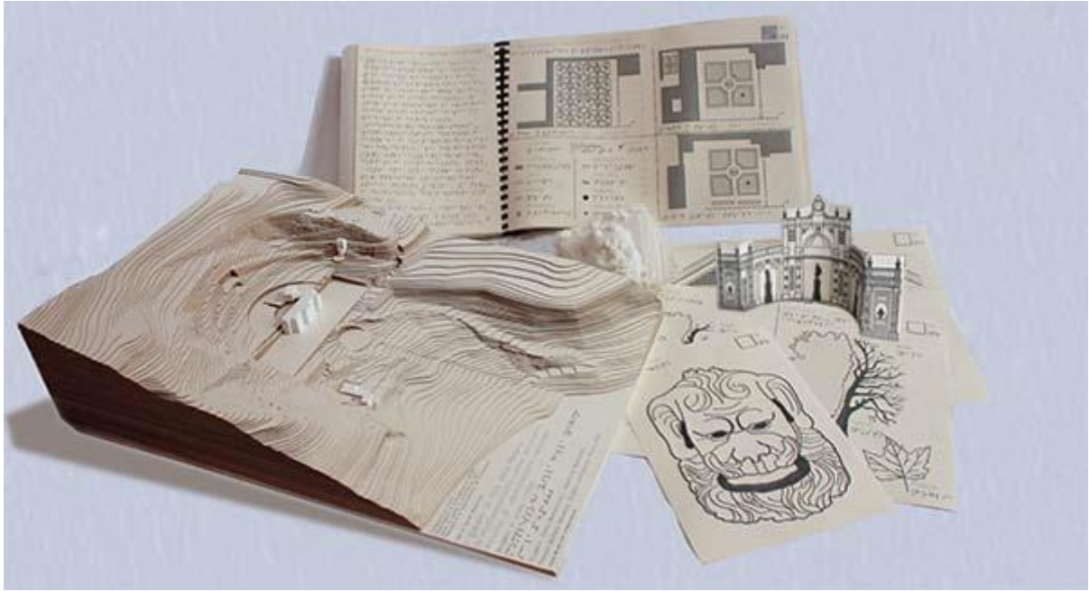
Photo of inclusive tools

The process for the preparation of inclusive tools was shared with the Soprintendenza per i Beni Storici, Artistici e Etnoantropologici del Piemonte and associations of stakeholders (Italian Union of the Blind and Visually Impaired section of Turin and Institute for the Deaf of Turin) to define in detail their requirements and to verify the effectiveness of the inclusive tools prepared either in the form, both in content. The comparison has been an important element in the growth and improvement of the work.