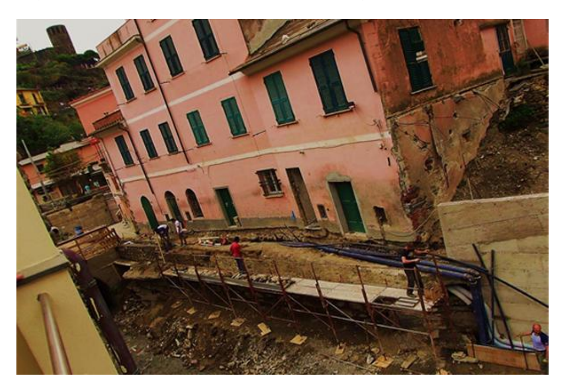
Vernazza, photographed on June 20, 2012 a year after the flood

There has been facing the problem of widespread agricultural landscape of the terraces with the dry stonewalls and its trail network, as fundamental characteristics of the landscape values of the Park itself. Vernazza, along with La Spezia province and Lunigiana have suffered the effects of the flooding that occurred in 2011.