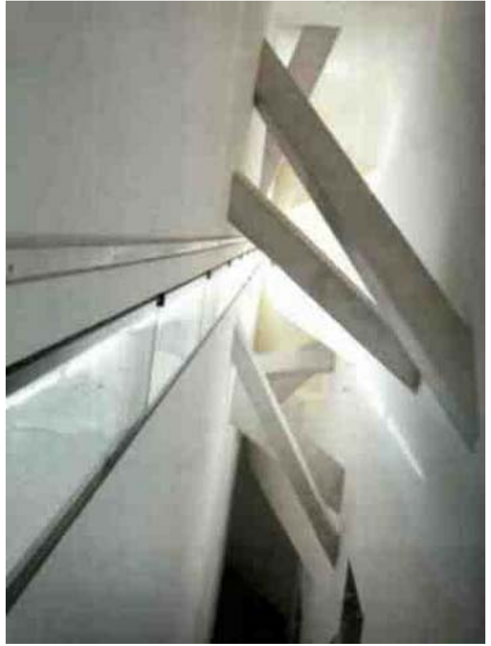
Daniel Libeskind, Judisches Museum, Berlin

Libeskind sees architecture as a language the line is not only a geometric event but is an extremely mystic concept which reveals conflictual fields of memory. Memory hos shaded surraundings as the bordes of absent meanings, limits in becoming, without any control. Absence is a way to deeply rebound hopes and fears shared through designs.