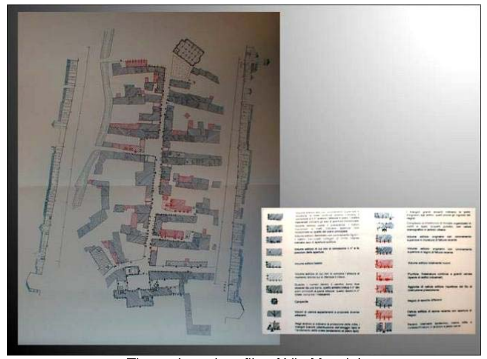
The cadastral profile of Via Mazzini.

The second stage of the investigation involved a detailed study of Lauriano's buildings and their recent modifications. Particular attention has been devoted to the local farmhouse and a country residence of the kind typically found on the Turin flatlands. The outcome of this study is illustrated on a map prepared in accordance whit the symbols employed by the Turin Polytechnic's Institute of Technical Architecture. The data supplied by the land registers drafted during the course of the centuries are also filtered through a historical table. The central role played by Palazzo Morra in Lauriano itself and its surroundings has been clearly defined.