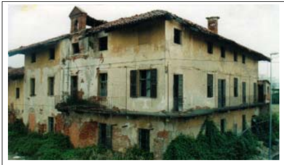
South-est view of the Cascina Borniola.

By using special instruments and photographs we were able to draw an accurate architectural survey and represent the real conditions of the Cascina Borniola, in order to recognize the different materials and structural elements that were part of the farmhouse, and represent their damages and defects. Defects have been represented by using Normal, C. Feiffer's and Dalla Costa's method, while damages with G. Tosti's one. After having analysed these damages and defects we realized that the serious conditions of the Cascina Borniola where due to a physical deterioration (caused by the rain) and a chemical one (polluted substances in the atmosphere combined with rain, superficial condense and dampness coming up from the ground) that got worse because there had been no maintenance. So we suggested a restoration of the fronts of the farmhouse and a consolidation of it.