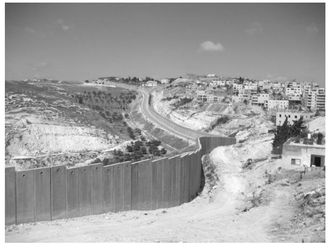
Outskirts of Jerusalem. Separation barrier and Israeli settlements in the Palestinian territories

Like most rural population in West Bank, the Bedouin Jahalin tribe resides in a well defined area where political, economic and bureaucratic trials influence, with the imposition of limits and boundaries, the quality of life of the Palestinian population. The research portrays the social, intellectual and technical requests of the architectural project which context focuses on removing any canonical meaning of the manufactured space. The architectural researched has been used in two different ways: foremost as an aid to understand the Palestinian area and furthermore as a possibility tool. The intervention inquiry of the primary school in the Al Jabal community was an opportunity to undertake a research of the context, through an analysis of the spacial and architectural stances of the Palestinian occupied Territories, with the objective of elaborating a project proposition for a school in the Jahalin community.