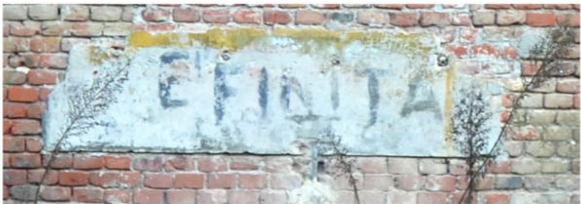
Image 2: Written in the south front of the Powder Magazine St. Thomas.

In 1949, the writer Giovannino Guareschi 1 noticed the word "Run!" on the wall of a building, together with the dynamic nature of the Citadel: his words resonate today absurd and linked to another time and another place. Today, on the south front of the Powder Magazine St. Thomas, in the only piece of plaster still intact, appears a written quite different, which states: "It's over" (image 2).