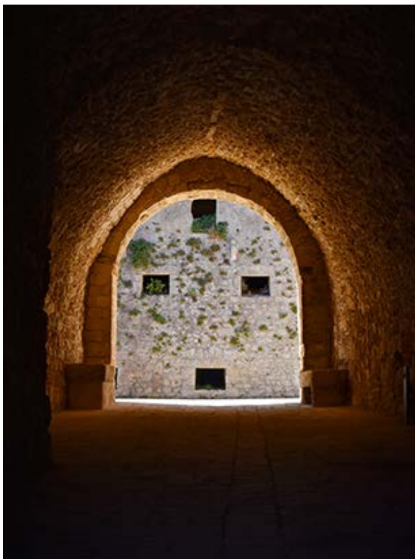
Uno degli ingressi del castello Alfonsino, Brindisi.