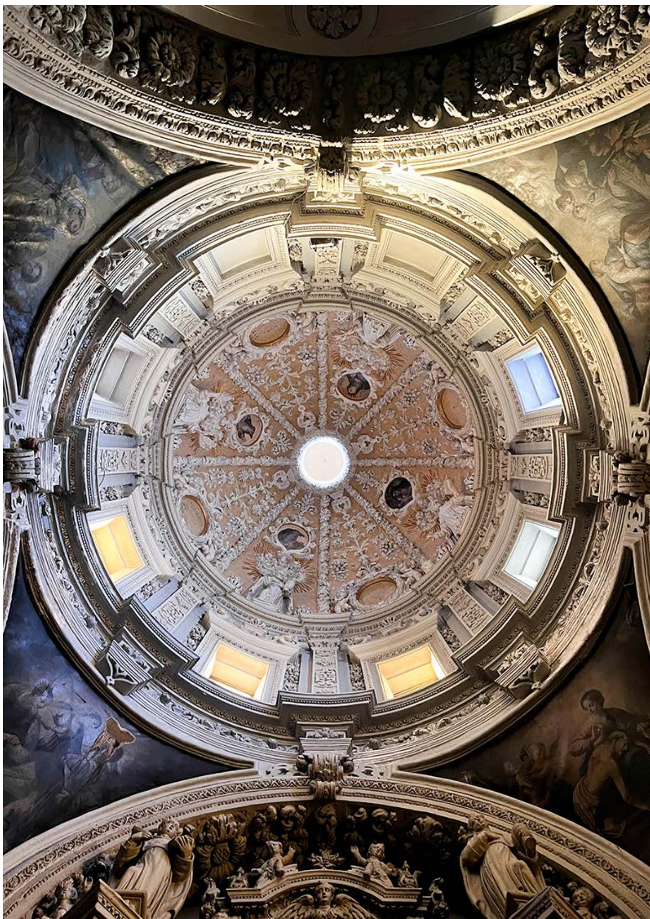
Il cielo della cupola della Cattedrale di Maria Santissima Annunziata, Grottaglie.