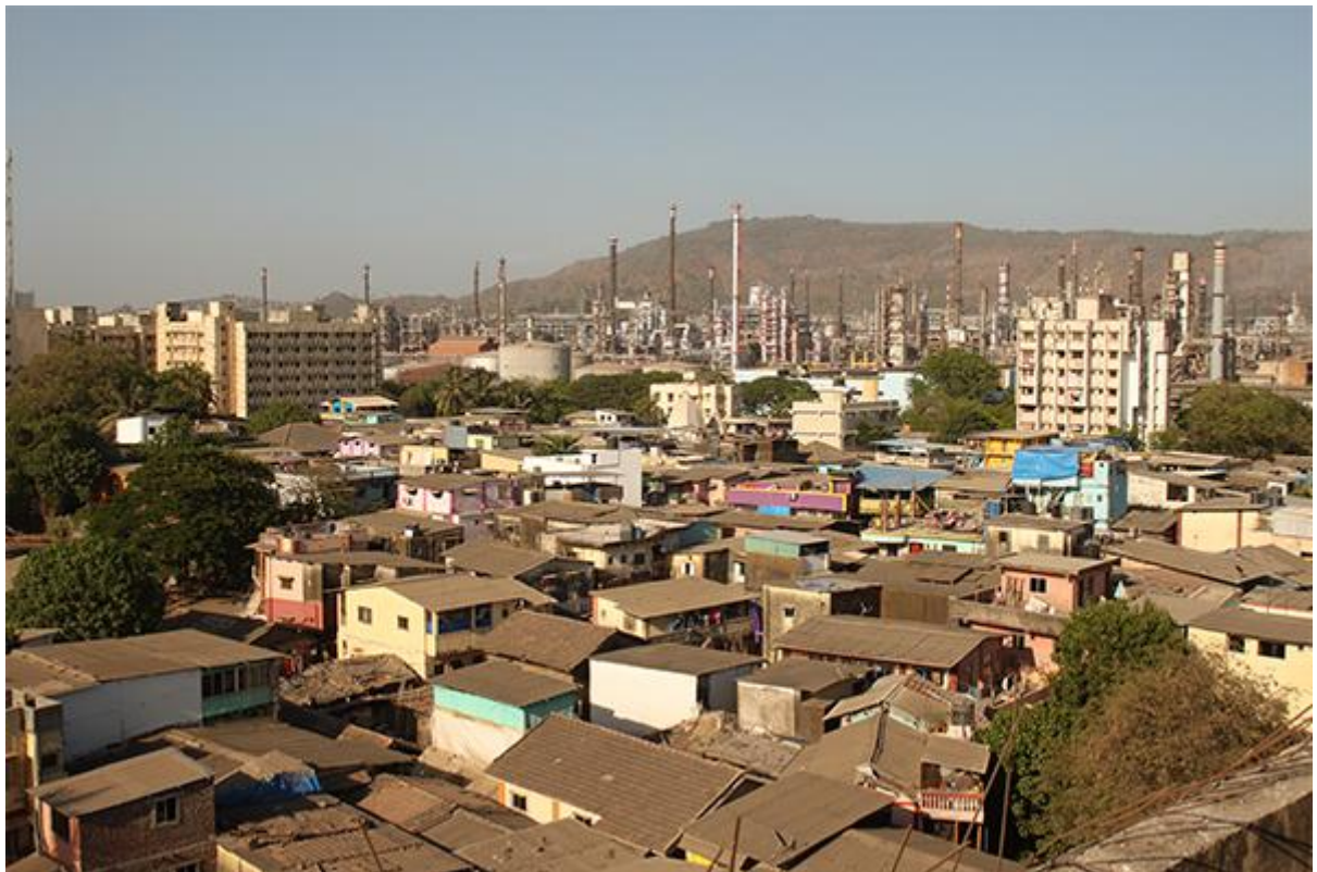
The relationship between Urban Villages and the Metropolis

It is highly difficult to see some order in chaos. The whole city of Mumbai could appear as an aggregate of informal neighborhoods, identifiable with the word “slum”, outside the borders of the modernly planned city. Some people see these slums as an illness, ready to attack the city and probably destroy it. However, this extreme simplification turns out to be completely false during the analysis which is here presented. In actual fact, if someone wants to understand the nature, the soul and character of this city, in other words its genius loci , he must fully understand the contradictory appearance that characterizes Mumbai. Nothing can explain this environment better than the “slum”, made of different cultures, histories and citizen relationships.