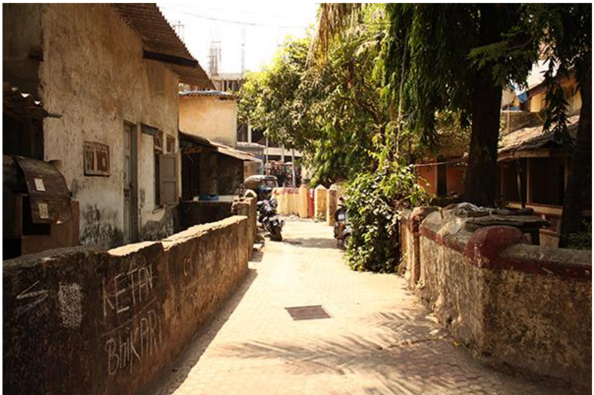
Inside the Village

In official documents we generally tend to refer to an urban development as to the extended areas outside a city as if they were a uniform not well defined area. However, the visits and the interviews of the inhabitants made it clear how these hamlets are different from one another, and how each of them has its own characteristics. Historically it is possible to define the generation of the big metropolitan area from the little villages spread throughout the old seven islands of Bombay. During the Portuguese and English colonial period, these little villages saw their biggest expansion and wealth. Afterwards, they were involved in the development of the modern city from both a geographical and economic point of view, passing from a rural to an industrial settlement. That caused a substantial lack of livelihoods, and the villagers were forced to adapt to a new social role. From this moment onwards the history of the villages is strictly linked to the modern urban structure in a mutual exchange of services and infrastructure struggling to maintain their social structure and traditions.