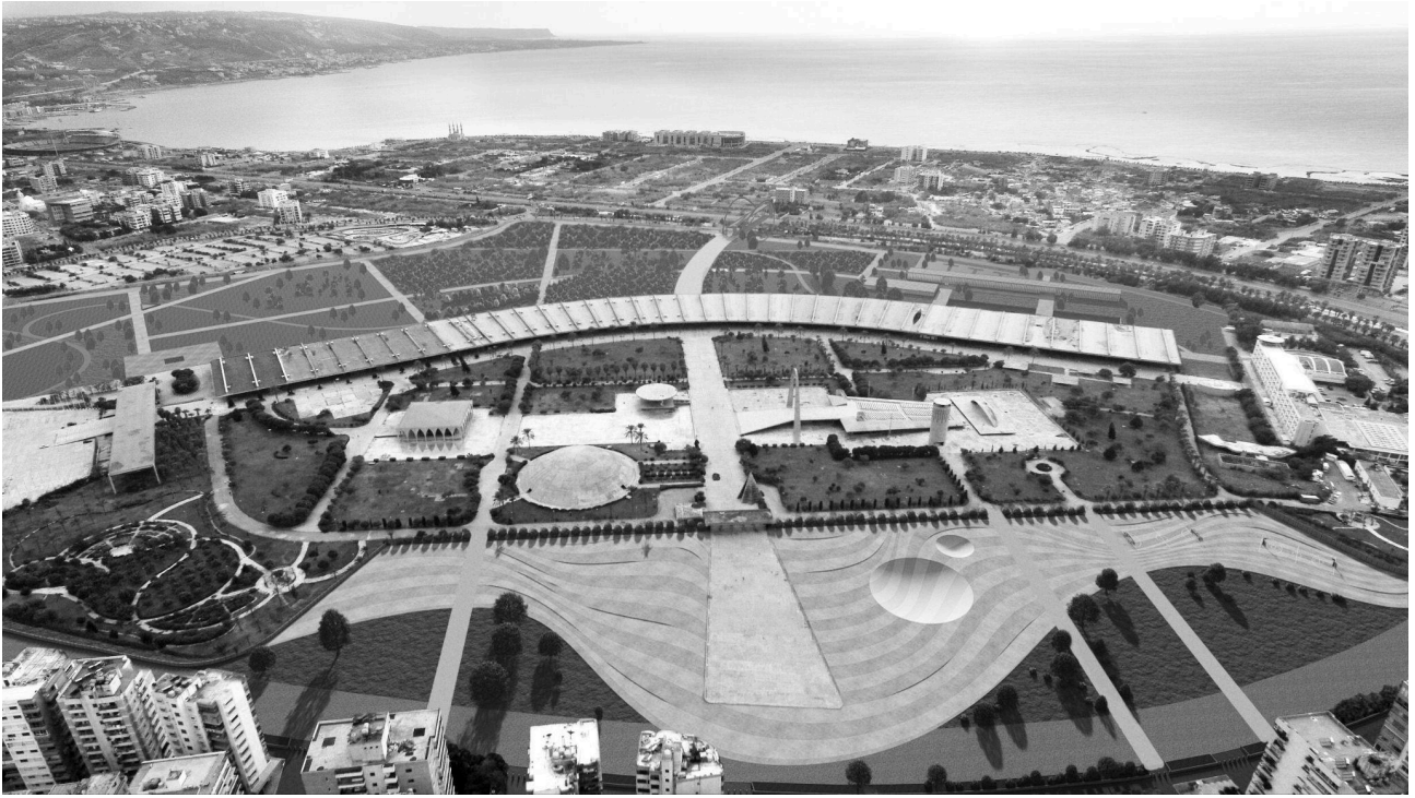
Render of the proposed masterplan intervention