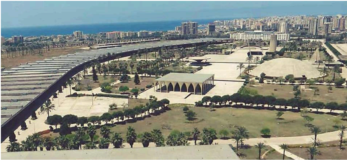
View of the existing site.