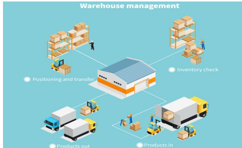
Figure 1. Warehouse internal processes

This research will conduct a comparative analysis of RFID technology and conventional barcode systems within the context of warehouse management, specifically evaluating their functionality, cost, and effectiveness. By comparing these two technologies, the study aims to provide a balanced perspective on the advantages and disadvantages of adopting RFID over traditional barcode-based methods. The analysis will delve into the functional differences between RFID and barcodes, including data storage capacity, read range, and automation capabilities. Furthermore, it will assess the cost implications of implementing and maintaining each technology, considering factors such as initial investment, infrastructure requirements, and ongoing operational expenses. Finally, the research will evaluate the effectiveness of both technologies in improving key warehouse performance indicators, such as inventory accuracy, order fulfillment speed, and labor productivity. This comprehensive comparison will offer valuable insights for warehouse managers seeking to make informed decisions regarding technology adoption and investment.