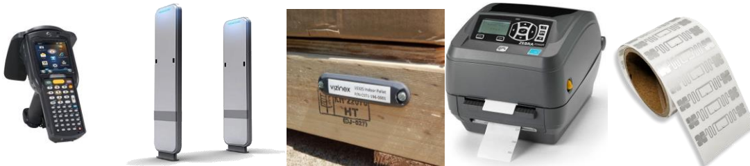
Figure 2. Reader (Handheld and Fixed), Permanent Tag, Printer, Product Tag

This combination of hardware components forms the foundation for a comprehensive RFID system capable of capturing real-time data on product movement and storage within the warehouse environment.