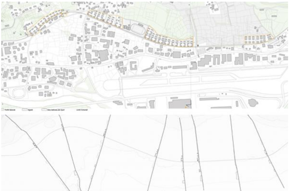
Masterplan project of Saint Christophe and Amerique area

The project is focused on the Nus – Aosta stretch (14km), a limited portion of the plain, which can form the basis for developing the aforementioned possibilities. In this stretch, intermediate stops have been identified, in either newly established buildings or previously abandoned and reused ones, depending on the users' needs and the various points of interest offered along the way.