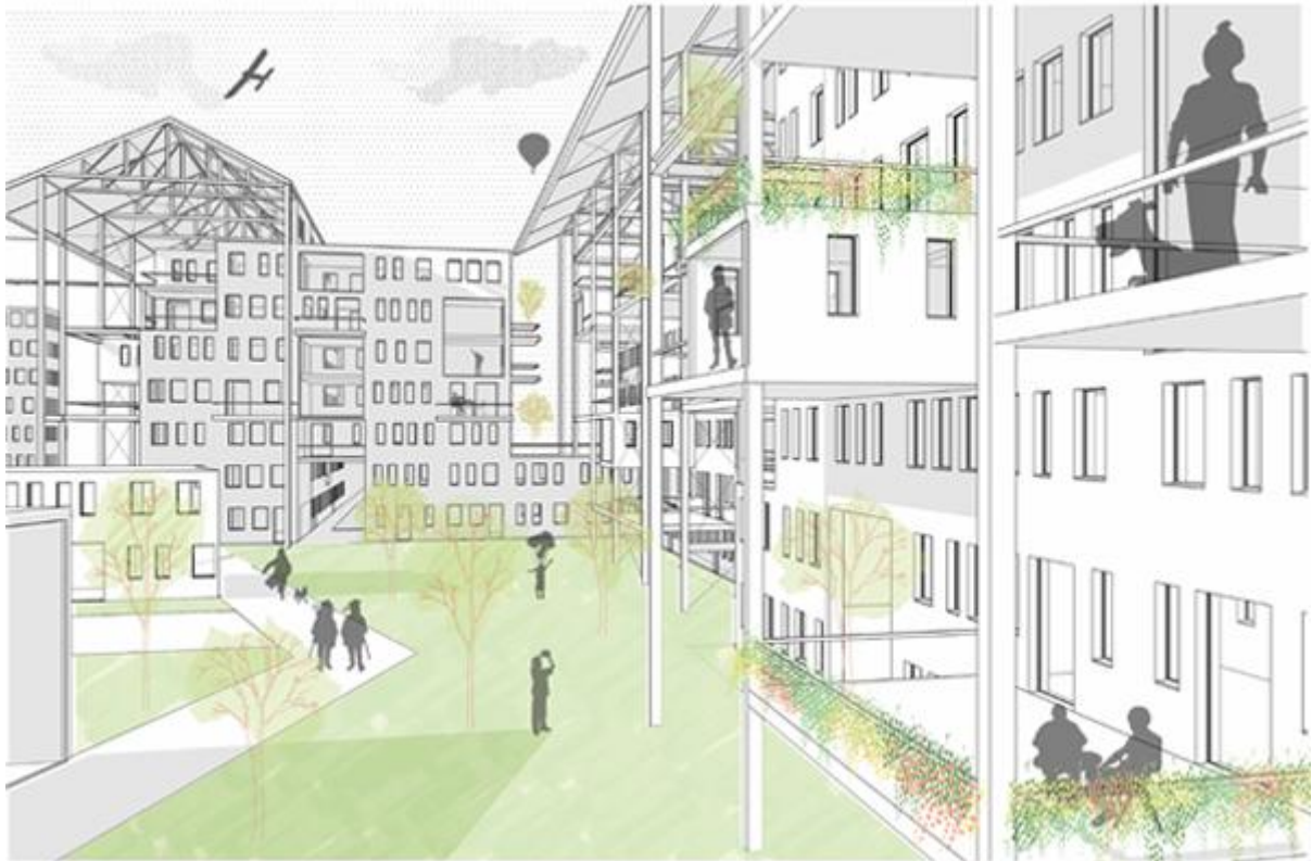
The redesign of Cogne Steel Complex Yards side view

Through the analysis of the existing settlement principles, we tried to understand how the urban cloth might change by a new infrastructural system, which would result in the mending of the urban tissue. Particularly, in the city of Aosta, the Cogne steel complex is being used as the basis for redesigning the area.