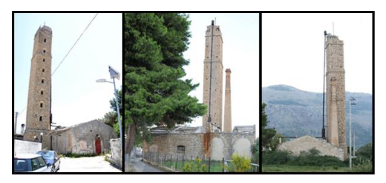
Water machine Maurigi - from left: west side, south side, east side

Few people know the historic agricultural structures, in particular "the machine of water" also called "water machines". This type of structure was very widespread in the province of Palermo and specifically in the plain called "Conca d'Oro". Water machines were closed over time and their working was completely transformed. Water machines originated from farming systems dating back the Arabian domination; a real management of water aimed to irrigate fields, above all for citrus fruits farming, which have always been the main element of the local economy of the territory of Palermo.