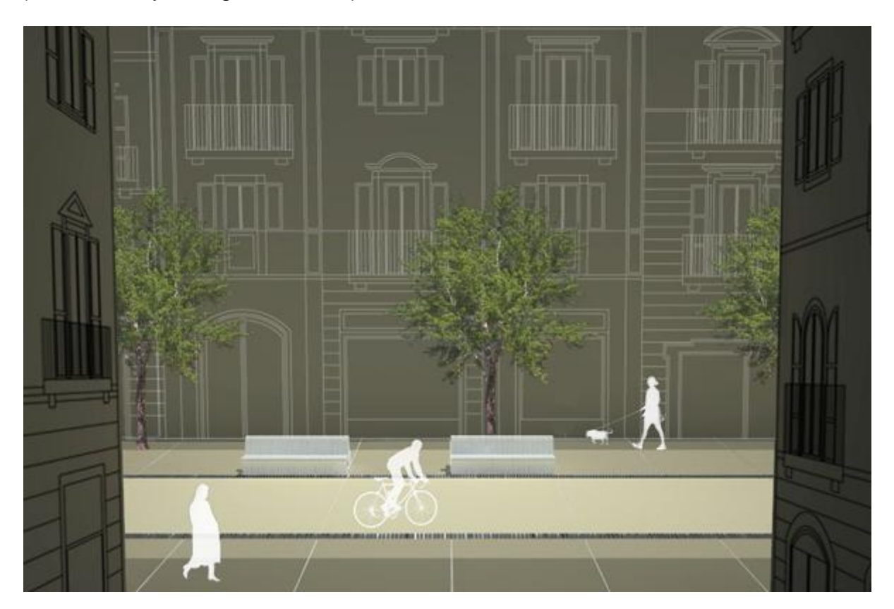
Via Berthollet urban regeneration

"BEyONd SAN SALVARIO" also translated as "Being San Salvario" and "Go Beyond San Salvario "describes the neighborhood with everything you will need and it represents and offers some ideas that are not perceived at the first glance. In the movie, images follow one another projecting the issues of conflict and the lack of space regarding population, landmark, mobility, art and multiculturalism. The categories majorly include physical spaces and social environments. The analysis was carried out on the public spaces linking observations with those of private places (courts, courtyards, gardens, etc.).