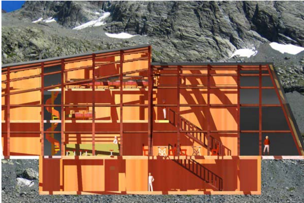
Longitudinal section. Structure and Volumetric Solution

The compact shape, the choice of technologies and the use of modern materials are justified by the good insertion in the landscape and the little environmental impact that the new structure has.