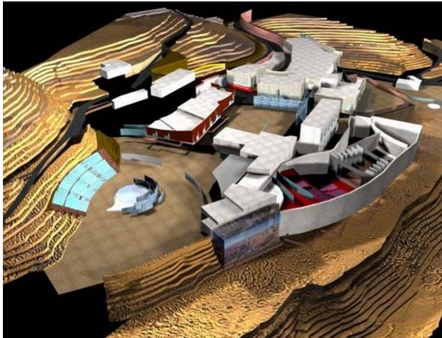
View of the complex and inside the theatre

The centrally located film and television studios are connected directly to the theatre and are equipped with multifunctional equipment for audio and video editing, virtual sets, offices and conference rooms.