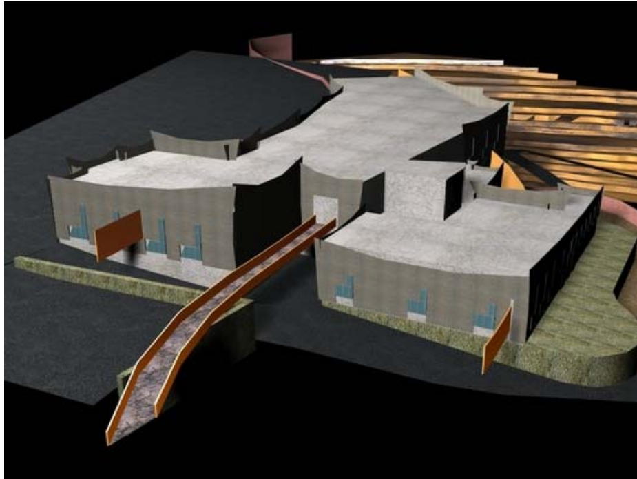
View of the television studios with the iron nets and L-shaped windows

The proposed intervention is aimed at a radical re-layout of the existing complex, which is on the other hand conditioned by an advanced state of decay, and at offering innovative solutions that seem to be compatible with the framework and with the recovery works of other buildings, included once again in the same context and recently earmarked as university buildings or logistic solutions suitable for hosting cultural events, conferences and exhibitions.