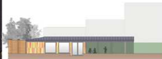
Prospetto nord del locale di trasformazione, scala 1:100