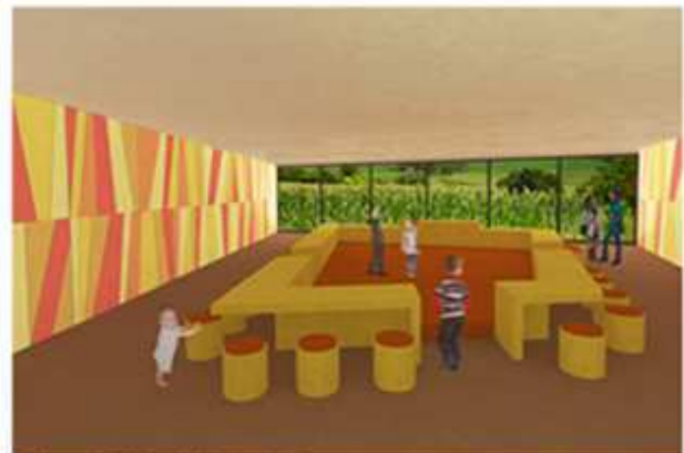
Render aula didattica dedicata ai cereali