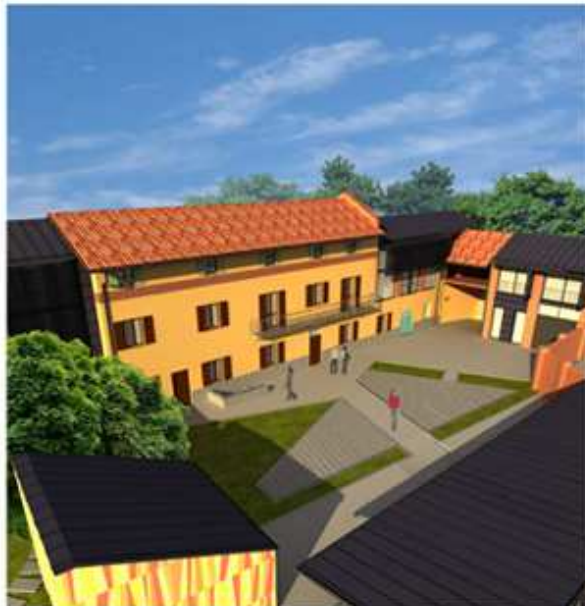
Render dell'intervento sulla cascina pre-esistente