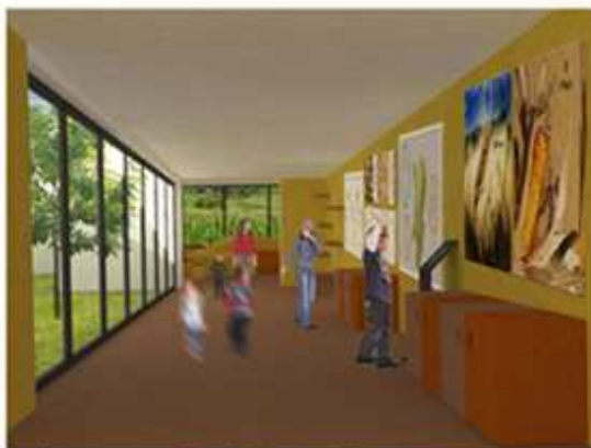
Render percorso espositivo dedicato ai cereali