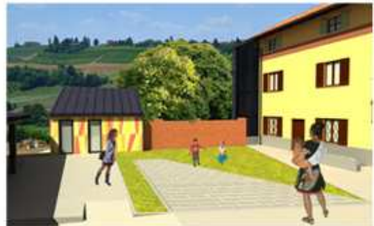
Render del locale d'ingresso alla didattica (ex pollaio) e vista della piazzetta