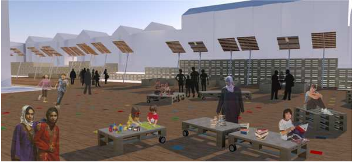
View of the area