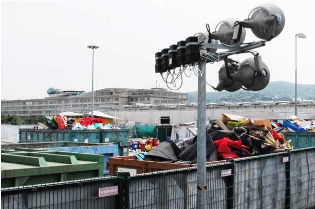
Thrown carpet waiting for the, Lingotto Fiere Turin, 2012

This product is composed by two different plastics with a considerable embodied energy. Every year, just in this exhibition center thousands of square meters of carpet-waste are produced. This entails a huge wastefulness of raw materials and energy because after the short life of the exhibition the carpet are thrown in the landfill. In Italy the recycling process is not practiced because it's still too expensive, hence reusing carpet represents an optimal solution. The product had been tested in laboratories to find out the possible uses as a building material. Thermodynamic, mechanical and ecological proprieties were studied to propose new technologic packages. Three prototypes were designed: a prefab façade for external walls, an insulation panel and an acoustic panel.