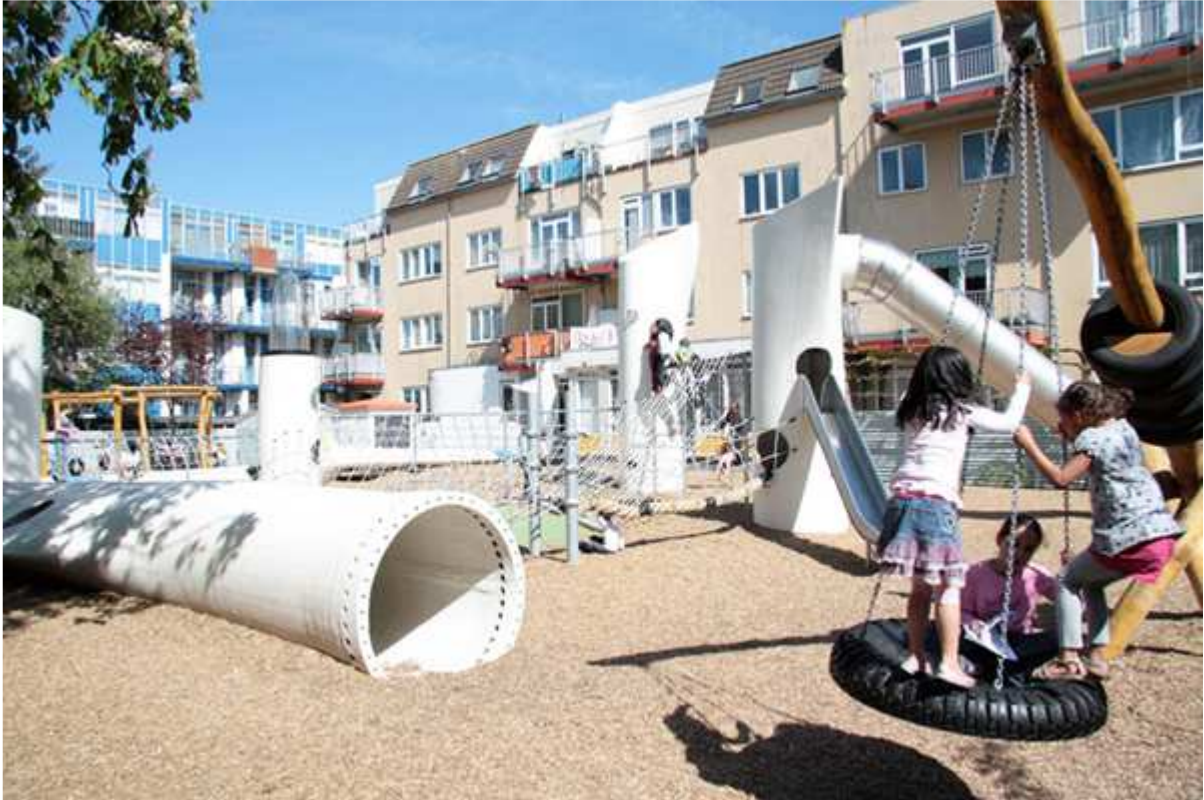
Wikado, 2012Architecten, Rotterdam, 2007

The main goal of the thesis is making this process feasible and repeatable by using a scientific approach. Since it doesn't exist a right and unique method, this work starts looking for built case studies, then proposes a method for the Italian context, following waste management and laws. This allows to select an approach from object to project , that begins by spotting available waste materials, then studies the single properties, and finishes by determining hypothetical uses. Furthermore the preferable subjects to supply waste materials are companies that produce scraps and by-products and other subjects that occasionally produce considerable amounts of refuses. The identified products and these information were collected in a summary table, leading to a single choice: a synthetic carpet used in exhibitions and trade fairs. In the thesis were tested carpet tiles coming from the Lingotto Fiere of Turin.