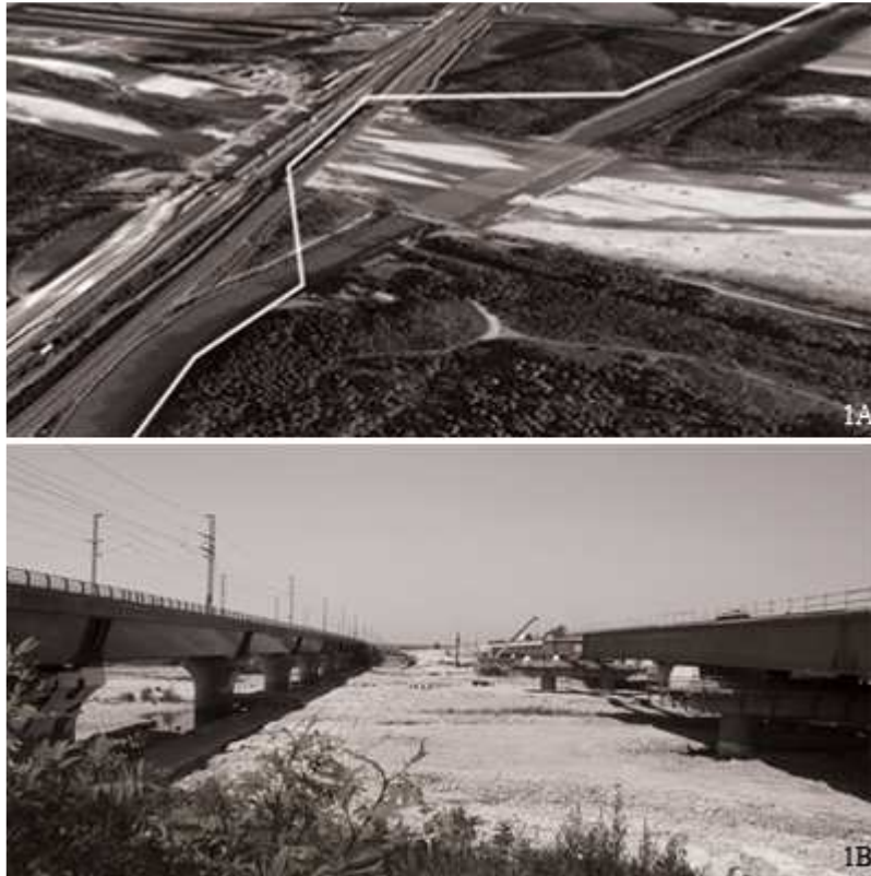
Fig.1A: The project site from an aerial view; Fig.1B: The river bed's width watched from the space between high speed train bridge(in the left) and the A4 highway bridge(in the right)

On further investigations , some important themes have emerged. Using these new details, we have defined the guidelines useful for planning the bridge into the right context of the site.