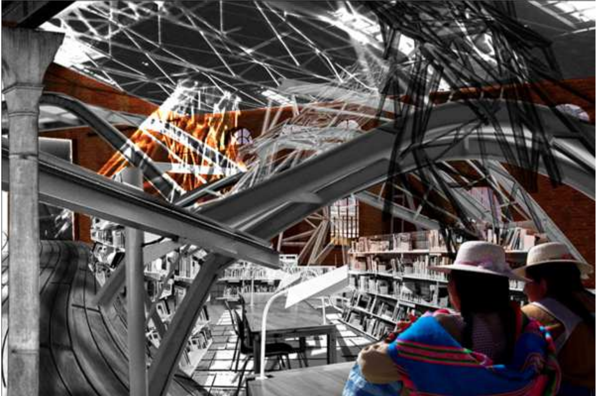
Cultural photomontage, workshop 7's interiors

The thesis proposes to develop on line with the architectural process that was followed in workshop of last year with the "Taller AVB". It like a notebook, of that "laboratory of ideas", that was part of the theoretical framework of the project. Project, that beyond the obtained results, that I consider great, has been a pretext to talk about architecture, to develop and to expand the creativity and the qualities that we have inside us.