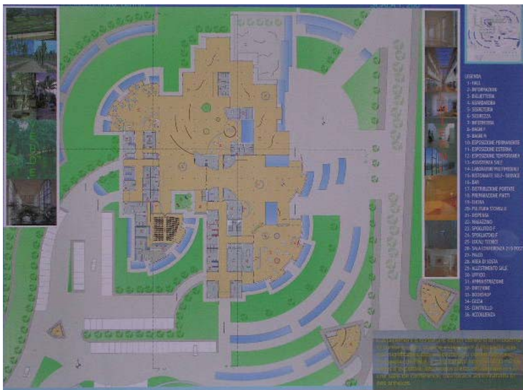
Plant floor 0

The area was former called " Quartier de l'Amphitêatre ", this name underlines the importance of Metz as a Roman-Gaelic city: the town wall and the foundations of the Amphitheatre, rediscovered in 1902, during the urban regeneration of the station area, still evidence of its past.