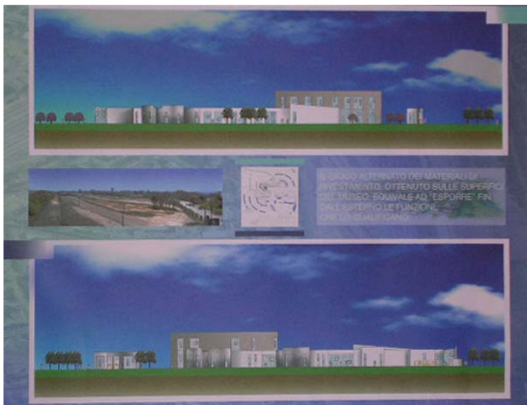
Prospects of the Museum (main, back)

Moreover, the use of various materials and also the presence of semi-cylindrical bodies (emphasized from the coverings in aluminium sheets) underline the idea of movement to the structure.