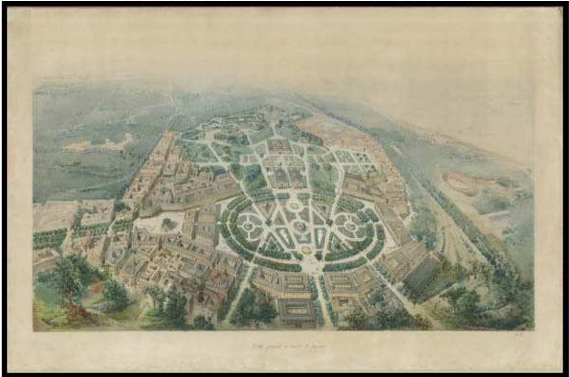
Vista general a volo de pajarro AHCB, Carlo Maciachini, Parque de la Ciudadela