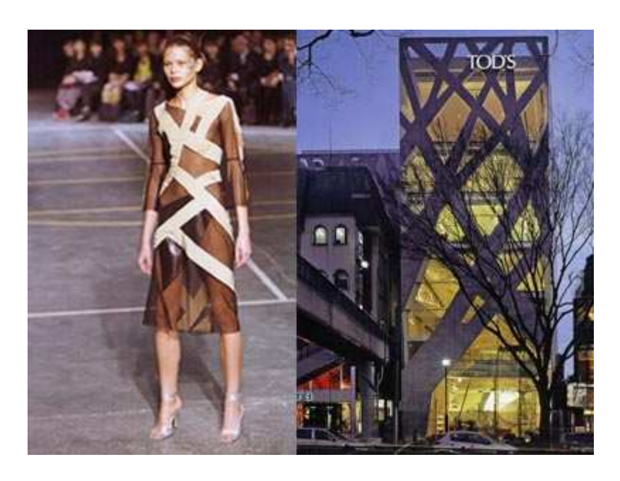
Way Dress by Yoshiki Hishinuma of Tokyo, 2004 Tod's Omotesando Building in Tokyo, Toyo Ito 2004

In fact, even in this circumstance, the fashion has been established with the work of great architects engaged in major exhibitions of the early twentieth century, from which emerged the work of renowned fashion houses in Turin of that time, which presented their creations. It was this great "success" of Italian fashion in Turin, which have seen many of the most famous architects of that period wrote up the guidelines for the construction of new stores, that had to respond to new needs and new trends of the moment.