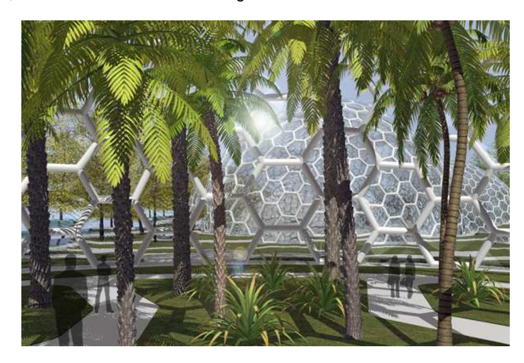
View inside the Tropical Orchard

Inside the original buildings which were riqualified we placed a bar, a restaurant, officies, laboratories and some teaching rooms.