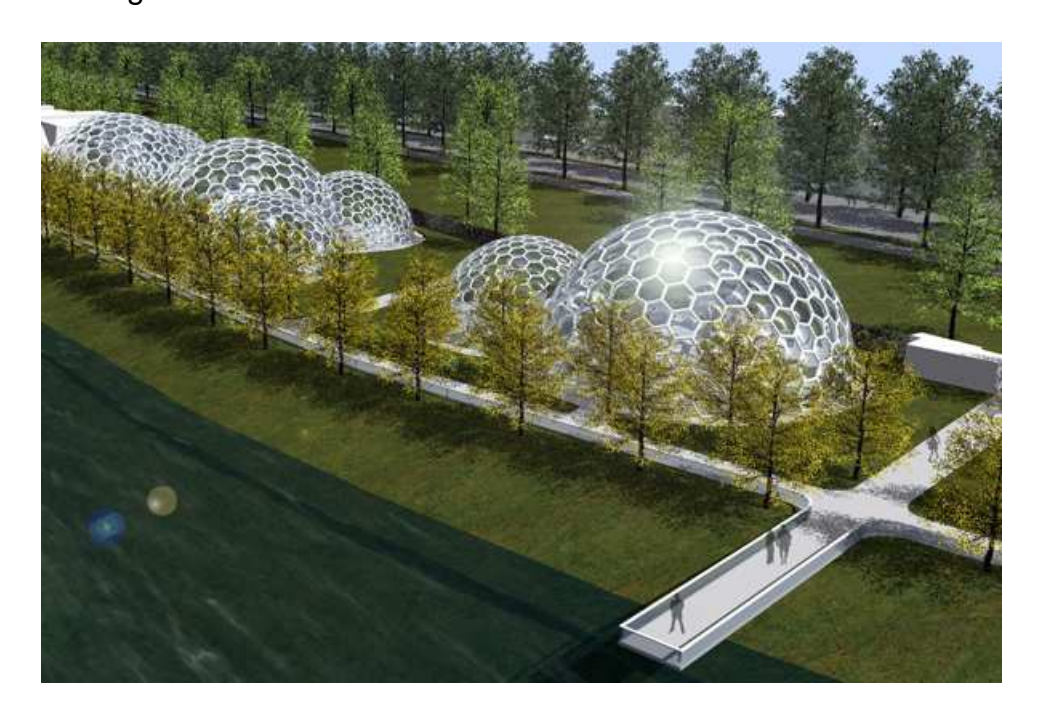
Overall view of the waterfront

The arboreal species, hosted by the ETFE biodomes, were classified and decripted in detail dividing them for climates and biomes.