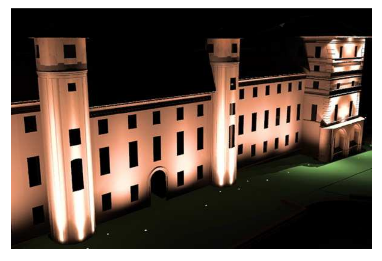
Render of Moncalieri Castle, made by Dialux 4.9