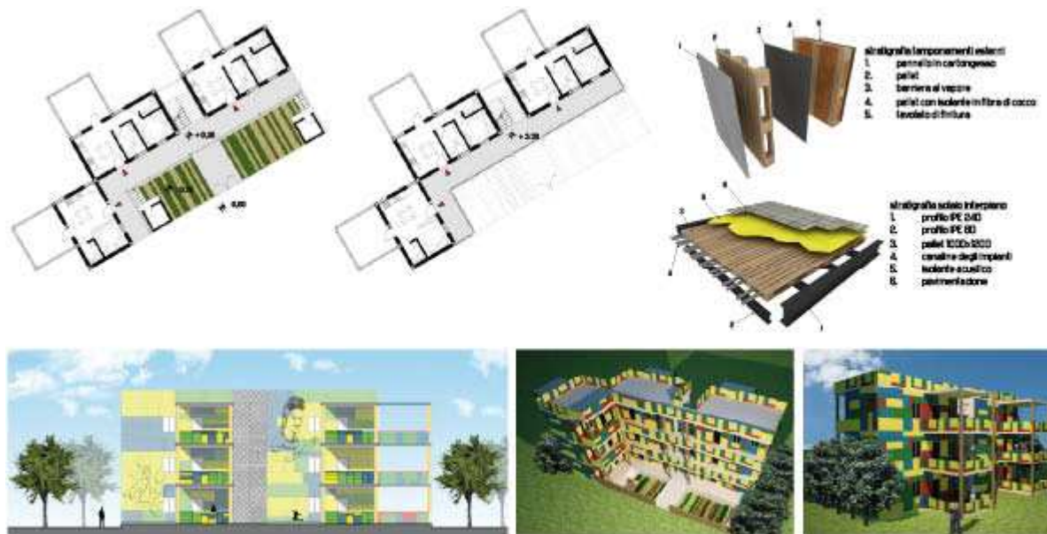
Fig.3 - Summary of housing units

The composition chosen, in continuity with the existing settlement, provide for two or three houses of three storeys, articulated around a courtyard.