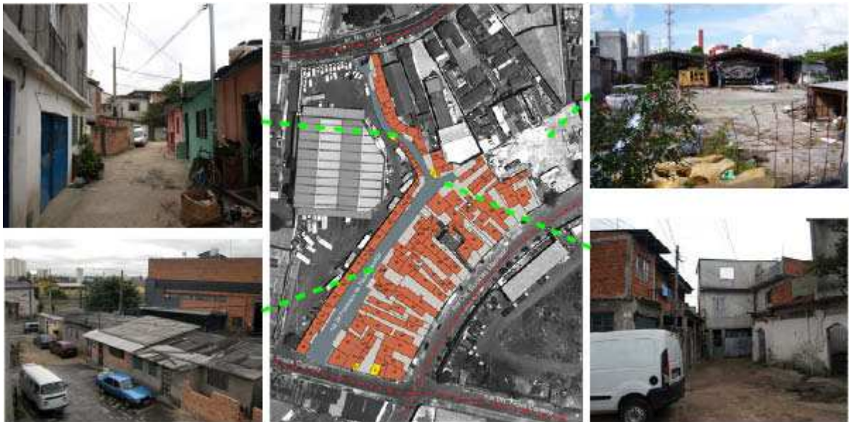
Fig. 1 – survey and photos of the area

Following the Brazilian experience our work suggests a possible next step: the redevelopment of the area. The proposal is based on two fundamental principles: community participation and re-use of local materials. The association of the inhabitants of the favela, acts as a hinge around the which rotates the project. For its requirements it will born new spaces that will handle itself dealing with the revenue they generate. Aggregation, recreation and production go hand in hand with the theme of re-use.