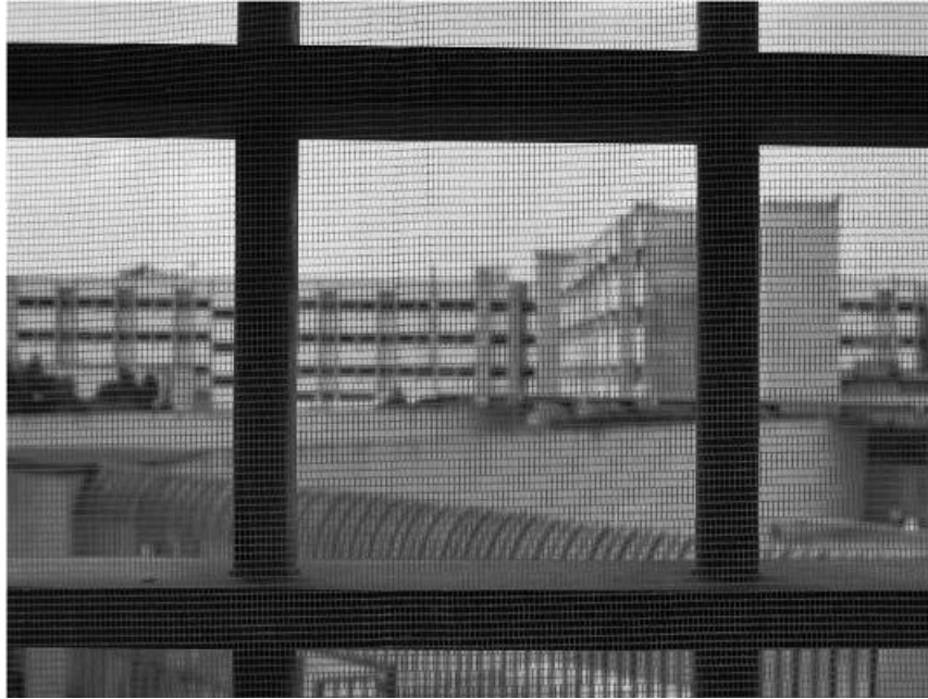
View from a cell