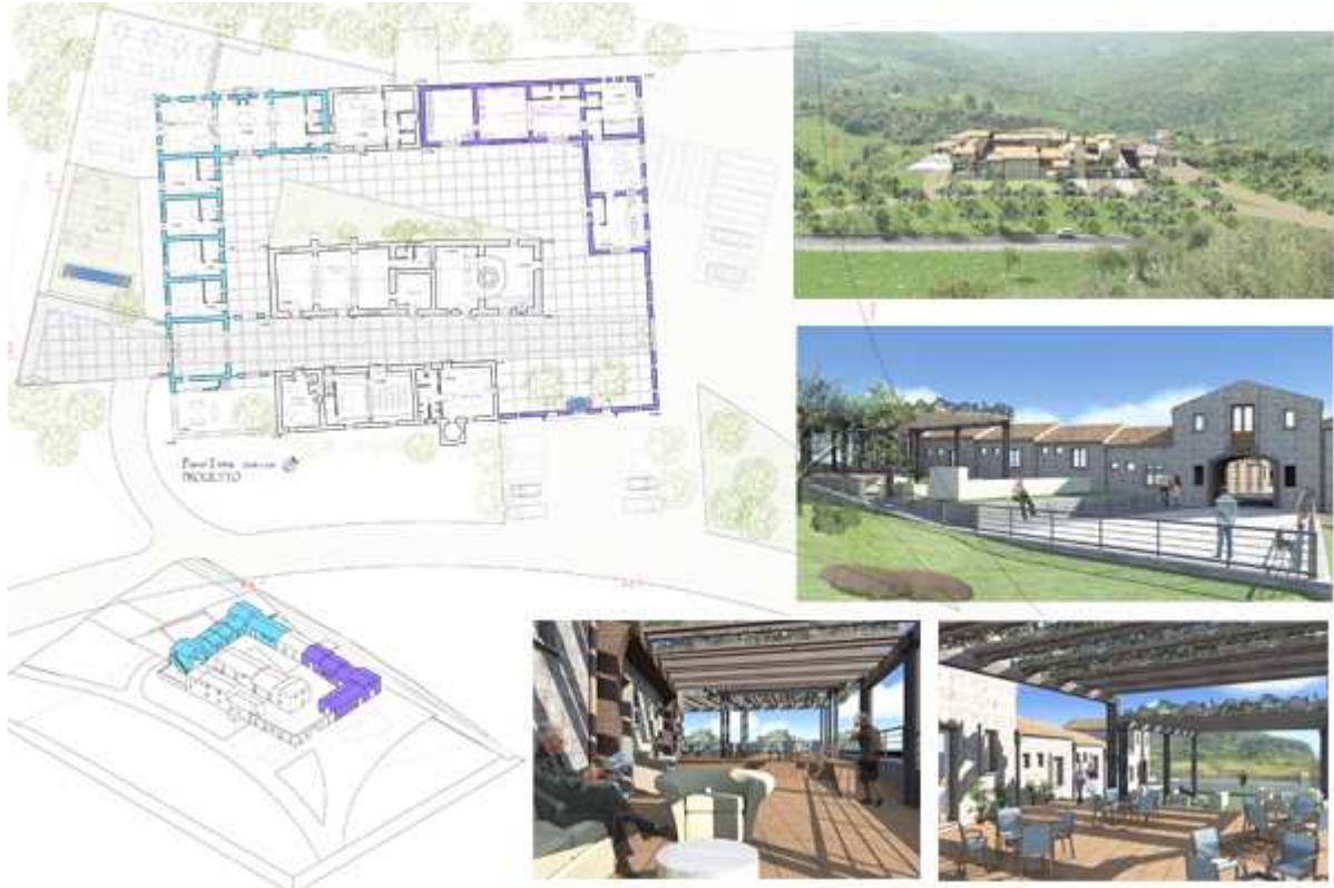
Architectural Design and Rendering with 3D Design

Architecturally the introduction of new functions has necessitated an expansion of volume, this was done taking into account that the current conformation is dissimilar from the typological Masseria, therefore in the process of architectural composition you chose to donate a plant closed on four sides by introducing two new volumes, North to the South the productive function for the function.