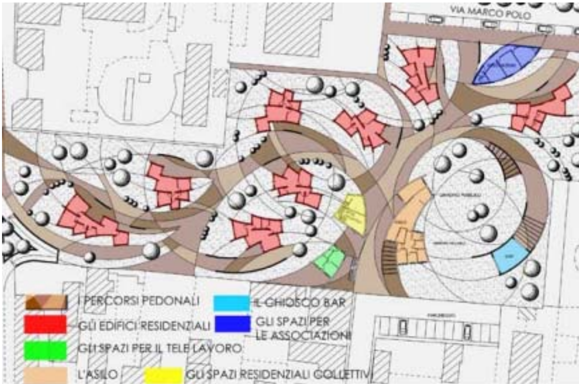
General planning map of the area

From the technological point of view our project is entirely created with dry stratified technologies as they can be easier placed in position, they assure a higher flexibility and better respond to the concepts of dwellings biology.