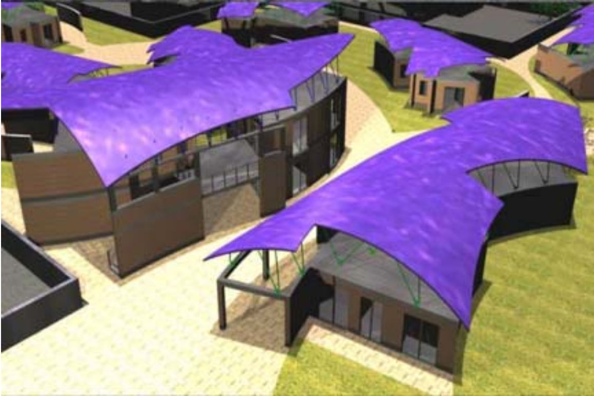
Nursery school view

At least, we look into the relationship with the local public Administration: our objective is to make the local Authorities themselves promoters of the project. In this regard we have thought of possibility of making a contest among young couples for the construction of a residential area, considering a space for a nursery school, one for telejobs and other common space, all given, for the running, to the families who won the contest.